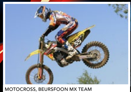
MOTOCROSS, BEURSFONN MX TEAM